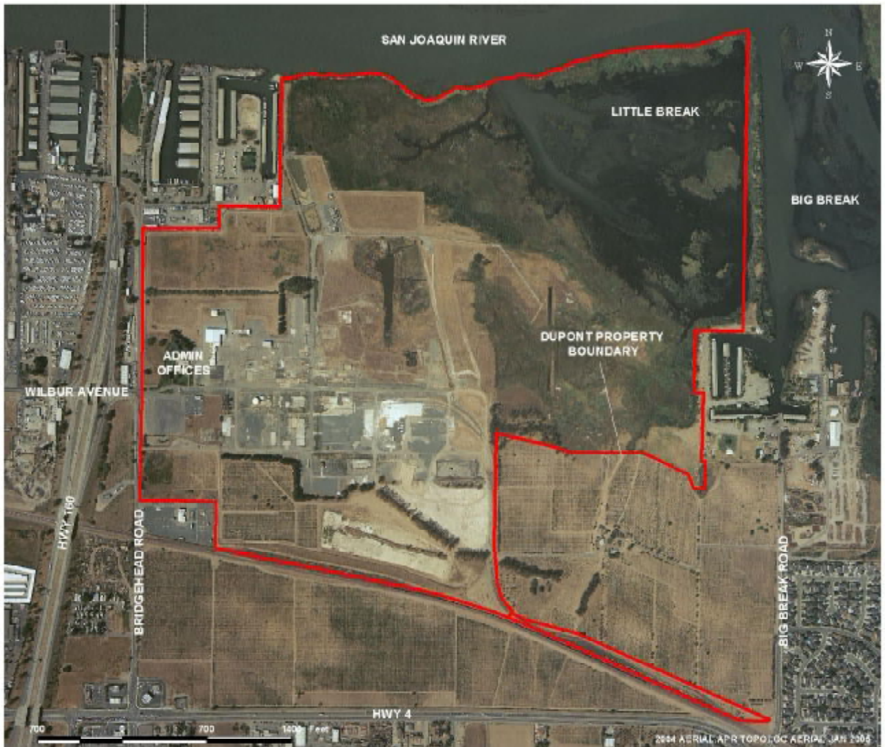
Figure 1. DuPont Oakley Site Location

next to the San Joaquin River. DuPont operated a manufacturing plant on the site from 1956 to 1997. At the height of its operations, DuPont employed nearly 600 people. Originally built to make gasoline «anti-knock» agent tetraethyl lead, DuPont also started making refrigeration cooling compounds called Freon®. In 1963, DuPont started producing titanium dioxide, a white pigment used in a number of household products and foods.